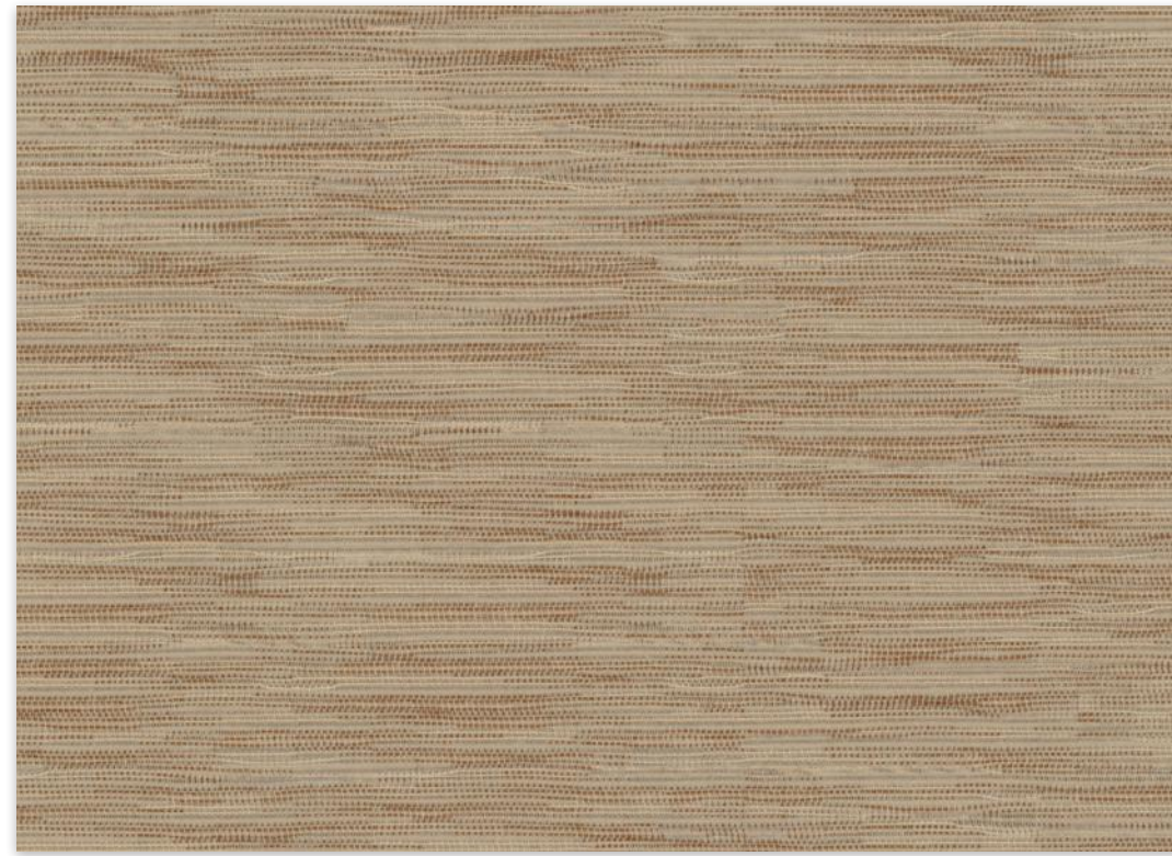
<1% Streetside 000NOV Nova